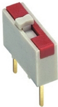
BSD-101 (Box Type)